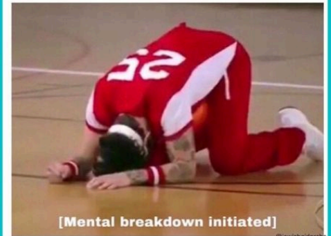
[Mental breakdown initiated]

When you find out someone ate the last bagel you were going to have for breakfast